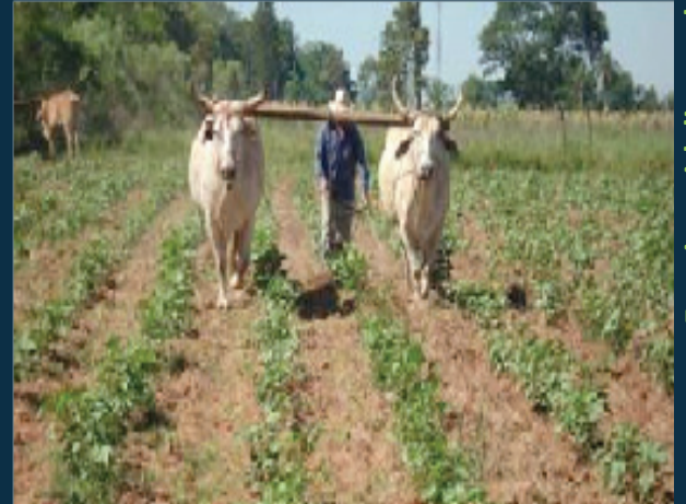
Farming with livestock