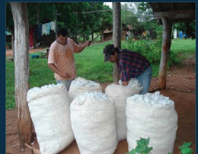
Organic seed cotton